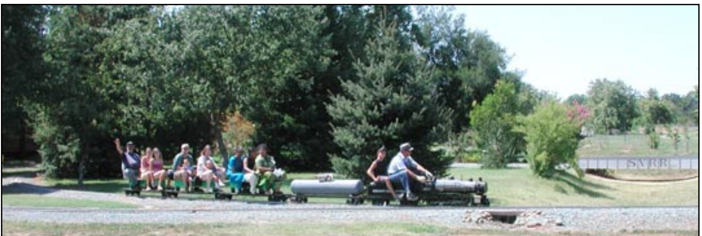
Guests enjoying the train ride through the park during run day. Les and Butch running the train.