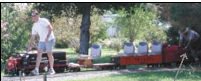
I think I can, I think I can, I think I can.