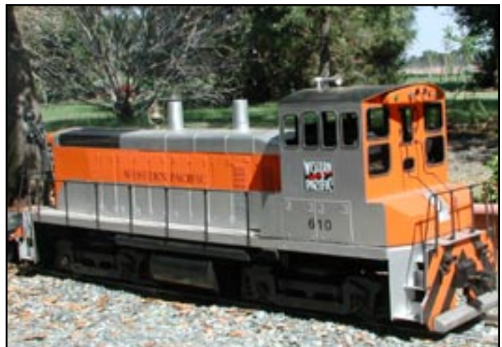
Milon Thorley's Western Pacific 1500 switcher # 610