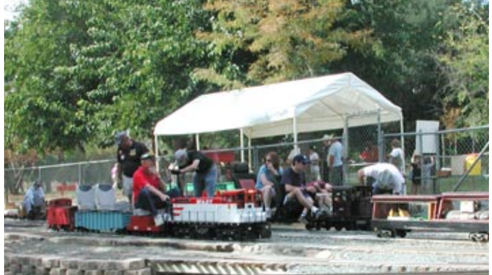
A busy station but all in a day of fun for everyone.