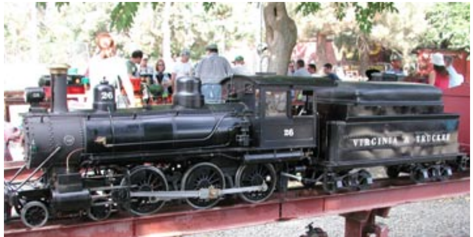
Cal Tinkham's #26 4-6-0