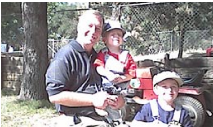
Dad and sons (engineers to be) enjoying Fall Meet

Work days are usually held on Tuesdays and the scheduled monthly work Saturday. Many other Saturdays are work days as well. E-mail (parney@pacbell.net) or call (916-988-2000) the Track Super to confirm a workday if you would like to be involved. Emphasis will be on tie replacement, tie screw tightening, gauging, and roadbed leveling with some limited rail replacement and switch repair for the rest of this year.