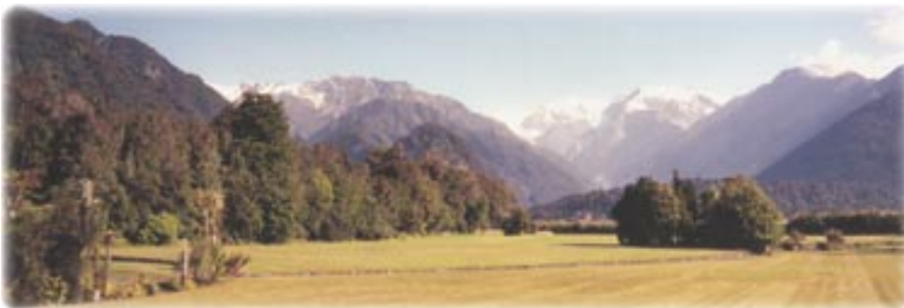
View from Milon's hotel room at Franz Joseph with the glacier in full view.

Marilyn Drews and Milon Thorley traveled to New Zealand during January 2004. They have nothing but praise for the whole country. The people are very friendly, the scenery is breath taking, the 14 miniature railroads they visited were outstanding. Between the two of them they took well over one thousand photos. They will collaborate on a presentation at a general meeting in the near future about their experience. All 1000 plus pictures will not be shown.