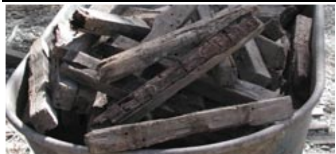
Tie replacement is an ongoing need. Here you see an example of how bad many of our ties are. There are many more to be replaced - come and help.