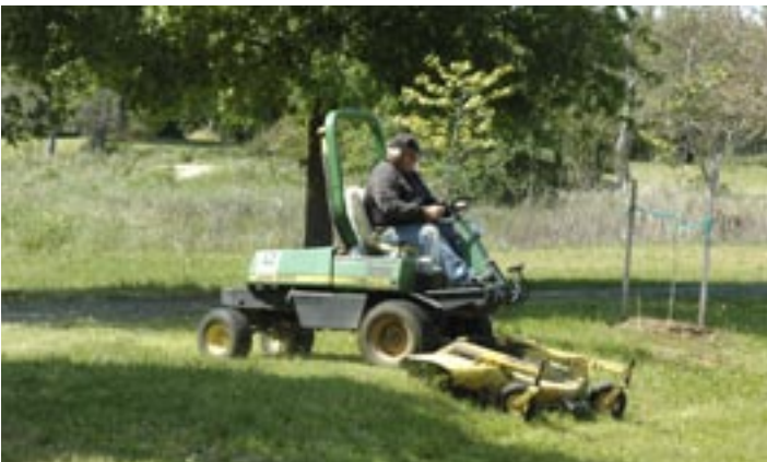
Paul Skidmore making fast grass cutting with the big mower.