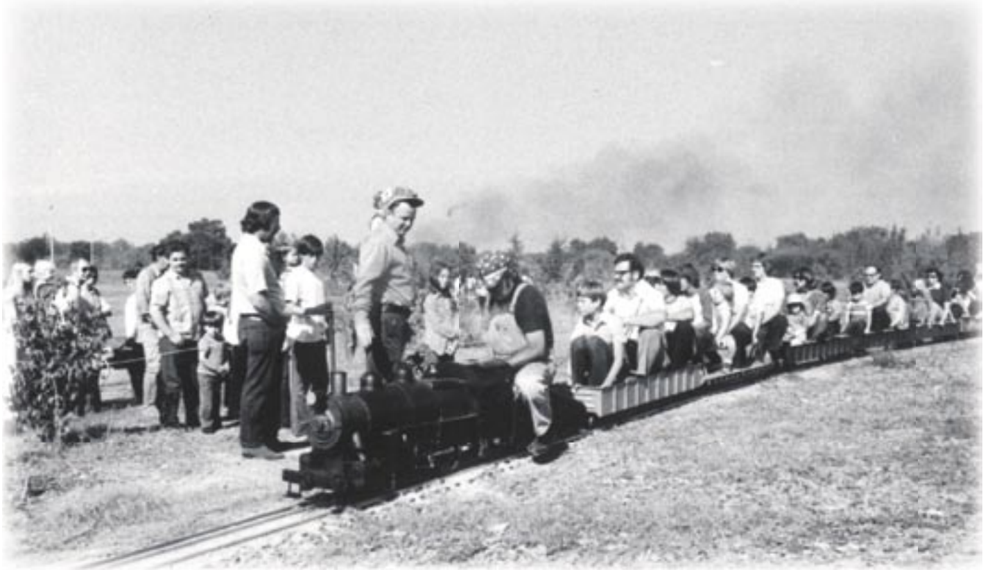
The early years (70's)