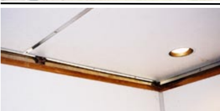
Sound barrier installed between wall and ceiling in our restrooms. Thanks Dale Folwar.