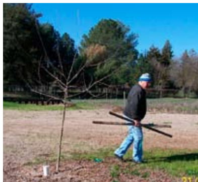
Paul Skidmore doing multiple tasks.