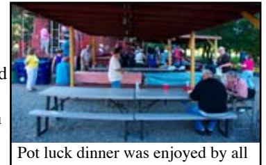
Pot luck dinner was enjoyed by all

It was great to see everybody out for our not-so-hot Hot August Nights event. Once we get past that, we are headed into Fall and all the great activities the change of season brings.