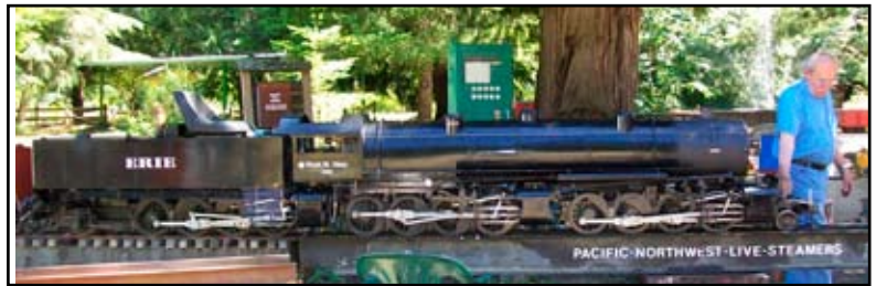
Larry Anderson and his triplex.

We are seeing some problems with soot building up in the boiler tubes. This was discovered on the last run day when we could not reach operating pressure. After a cool down Ed and I pulled the smoke box front off and discovered that all of the tubes were over 50% blocked with soot. We punched the tubes, of course, and the engine ran beautifully during our Hot August Night party. I have since been told that steel tubes will soot up faster than copper due to the difference in heat transference(?). In any event the fuel air mixture of the burners is still not right and needs to be corrected. If any one has any ideas I would appreciate hearing from you, for now we can manage by punching the tubes out every month or so.