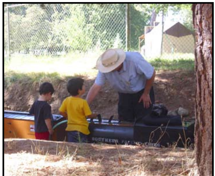
Wow! this is fun!

Absentee ballots will be mailed shortly after the October meeting, to be received back by November 19 prior to the annual meeting and election.