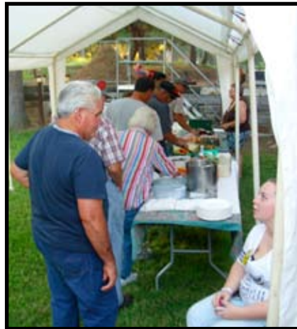
Saturday Dinner included a wonderful spread of food.