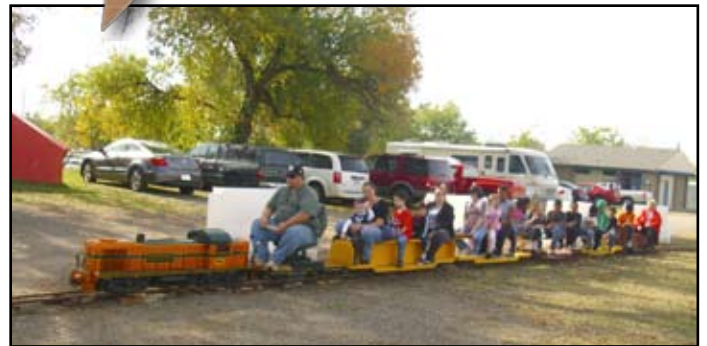
RAIL FAIR VOLUNTEERS – by Clio Geyer

Please give Clio a call at 916-645-9154 to sign up to help. I know that a lot of the usual folks will be there, but it would be great to see some new faces having fun!