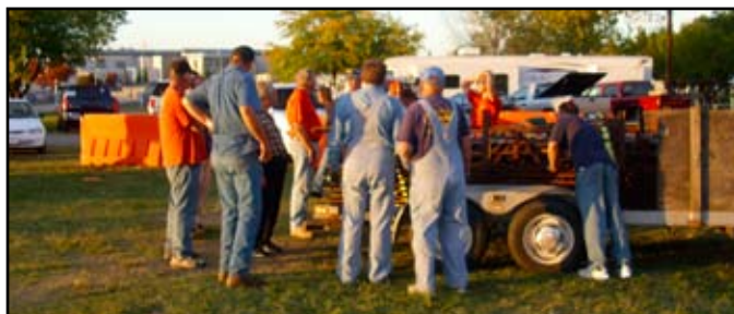
How many SVLSRM volunteers does it take to load a trailer? Simple answer Many - Thanks to all that helped at RailFair.