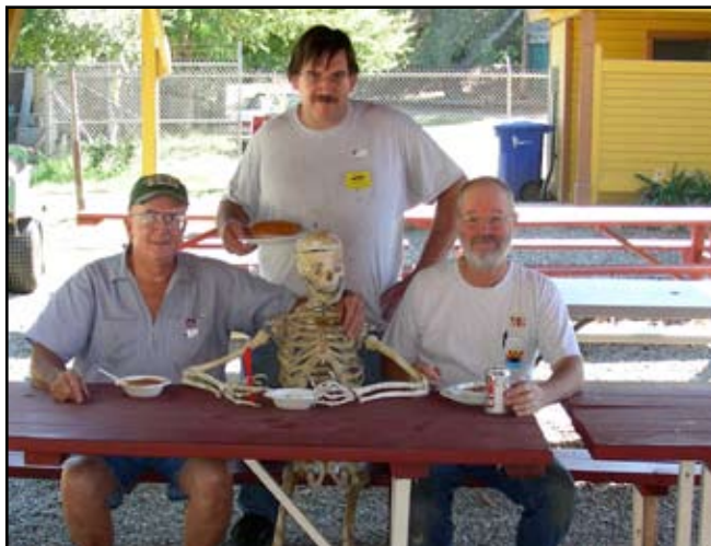
SVLSRM volunteers have been know to work themselves to the bone.