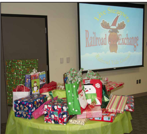
Members prized gifts overflowed the table waiting to be picked and stuck in someone else's home until next year.