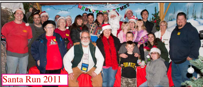
Santa Run 2011