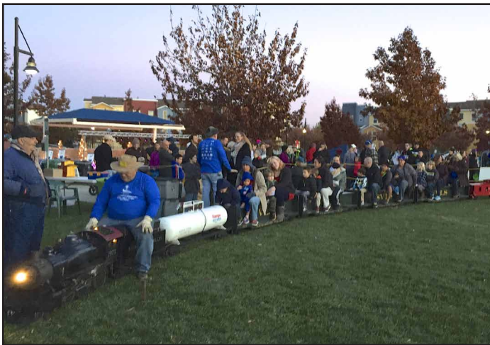
Rancho Cordova Christmas Tree lighting with our train running on a small loop at the event. (Photos above and below)