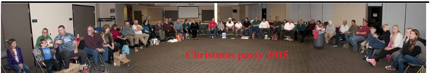
Christmas party 2015