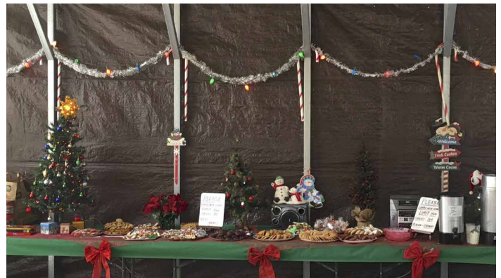
Santa Run cookie table