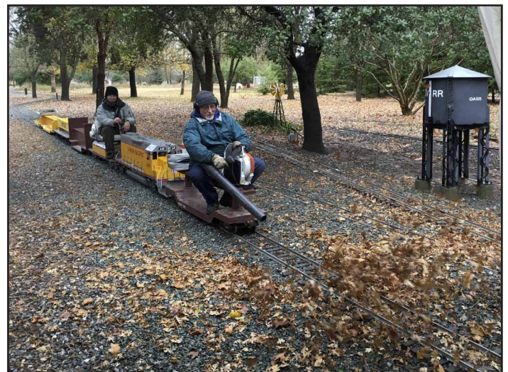
Have leaf blower will travel.

Thanks again and I hope to see you out on the rails.