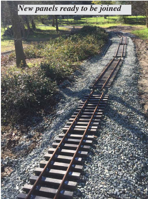
New panels ready to be joined