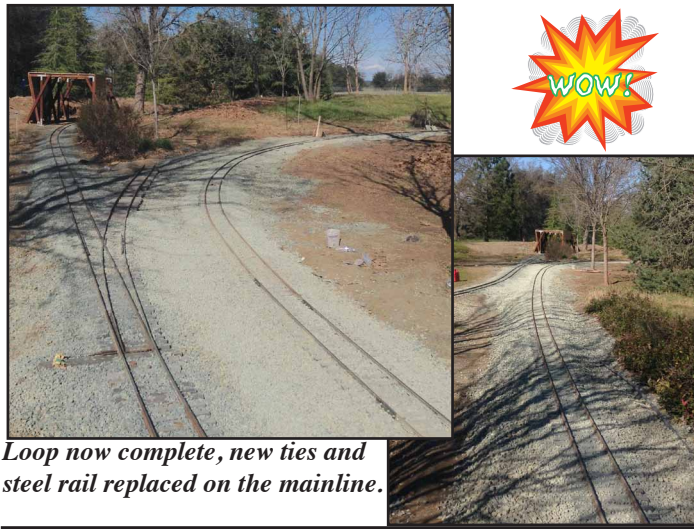
Loop now complete, new ties and steel rail replaced on the mainline.