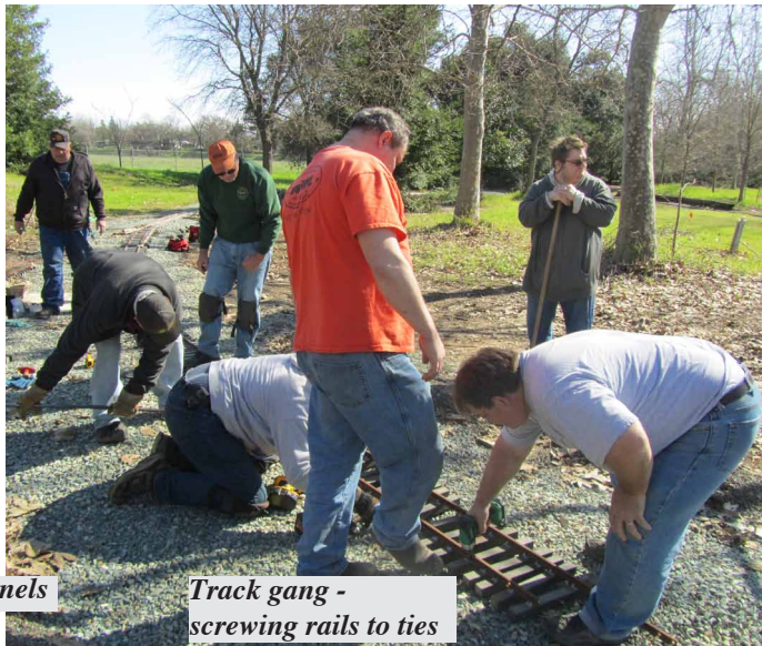
Track gang - screwing rails to ties