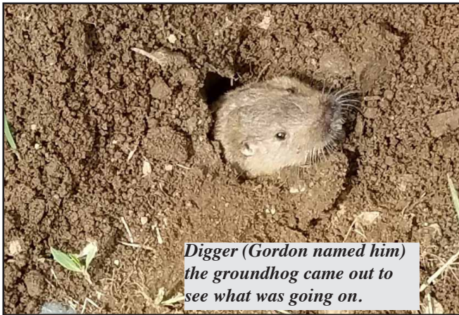
Digger (Gordon named him) the groundhog came out to see what was going on.