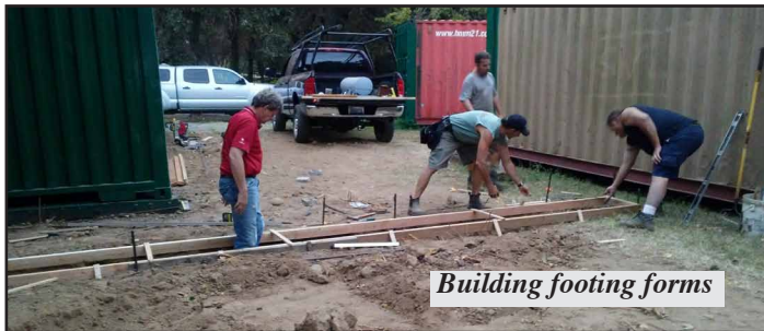
Building footing forms

The forms for the footings for the containers were completed. The rebar is in and tied. The concrete was delivered Monday September 25. A huge THANK YOU to the crews that got er done! We Hope to place the containers on Saturday 9/30. The plan is to move the containers into place late Saturday after the Birthday party and petting zoo runs.