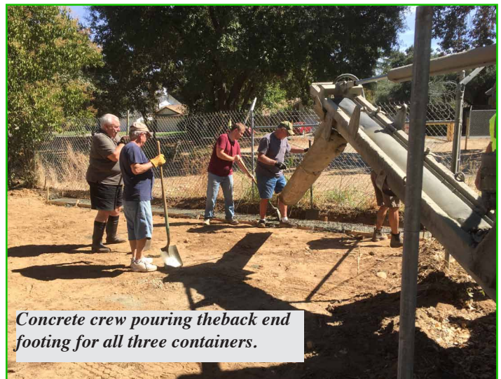
Concrete crew pouring theback end footing for all three containers.