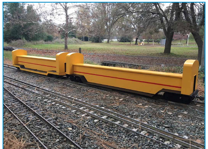
Work on the new riding cars continues as two of the four are now completed.