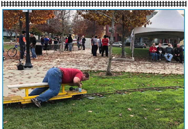
Our Track Super is just rolling along checking the portable track at the Rrancho Cordova tree lighting

accomplished. While we can always look back and say this or that should have been done, still, I believe we should be happy with what the Club has achieved in the past 12 months. Some of the accomplishments and highlights of the year include; The trip to Reno on AMTRAK, com-pletion of the fence around the steaming area, building of the shelter, installation of the hydraulic loading lift, building and installation of a chemical toilet, a manned booth for three days at the Sportsman's show in Cal Expo, a two day exhibit of steamed locos at the State Railroad Museum, 2 successful Meets complete with banquets, a special run day for the Air Force, acquisition of a large metal storage cabinet, 13 new members and a host of new friends. All of these things came about through the hard work of a fine Board and the many members who put in their time, money and effort. I want to thank you all, men, women and children, for there were whole families involved in these efforts, for making this such a rewarding and pleasant year for me, as President. Everyone have a wonderful Holiday Season and the best ever New Year. - signed Dick Esselbach.