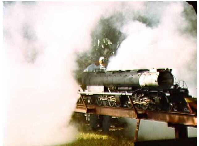
FLOYD EPPERSON'S "BIG BOY" BLOWING DOWN