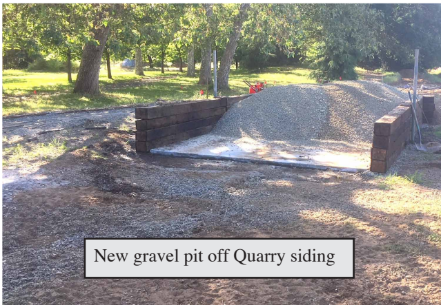
New gravel pit off Quarry siding