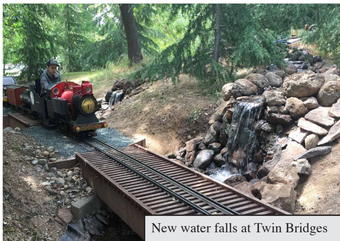
New water falls at Twin Bridges