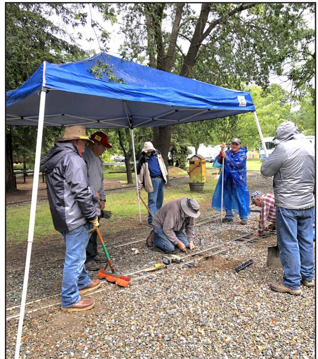
Sagebrush Shortline group doing tie replacement.