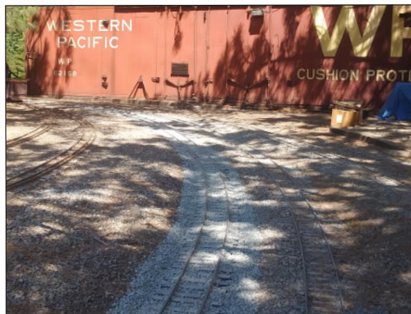
Another view of leads