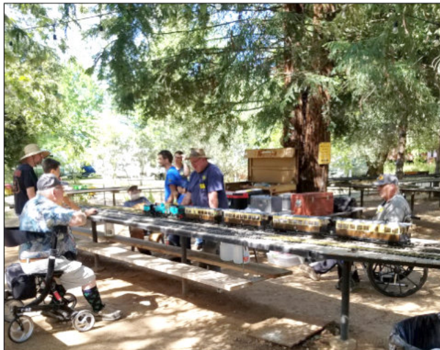
G Scale table was busy with many trains.