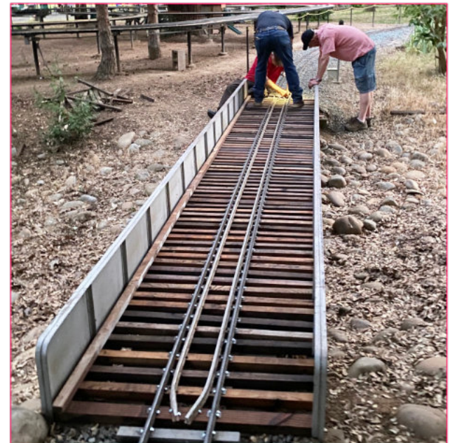
Completed project of tie replacement on the girder bridge.