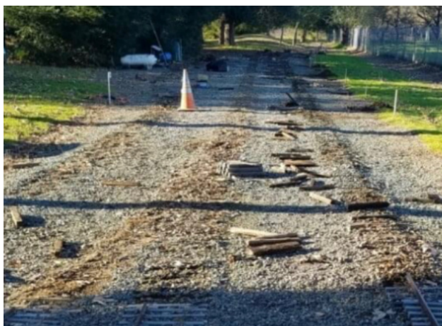
HillView after Old tracks removed.