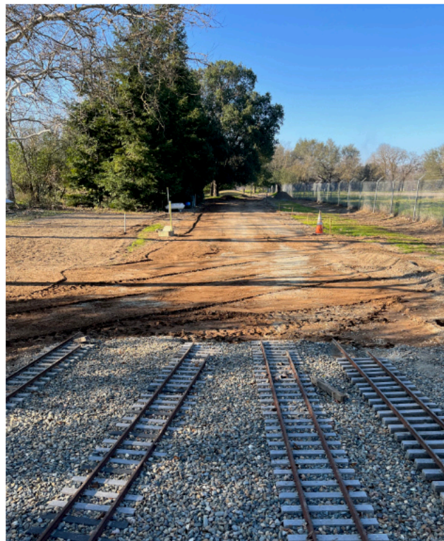
Now ready for roadbed