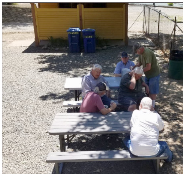
Old Timers Work Party