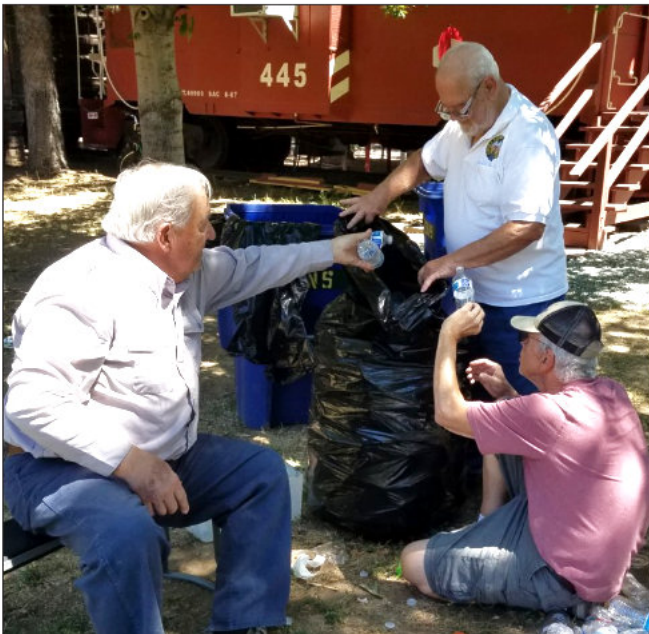
Sorting water bottles and Soda Cans. Thanks GUYS!