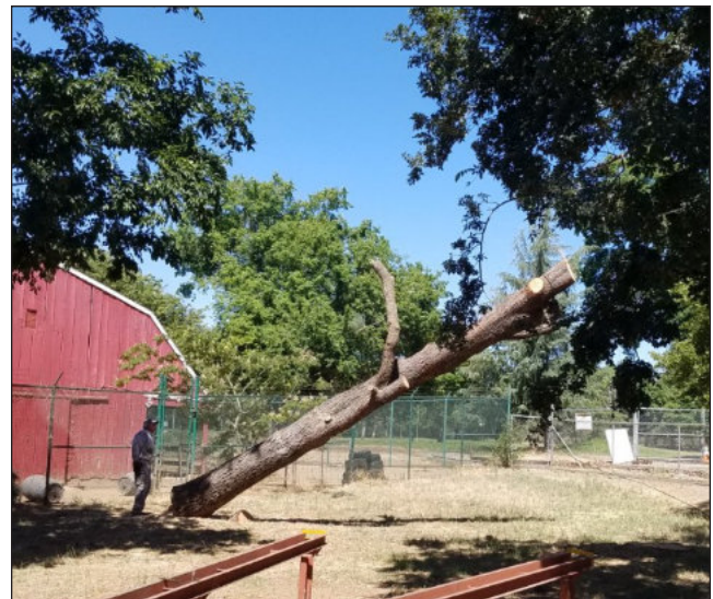
7-23-2022 The 2nd tree on its way down.