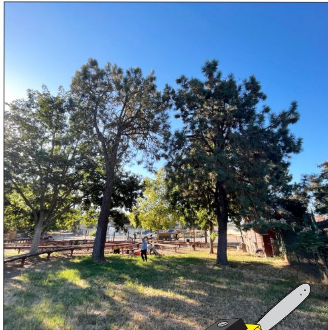
The two pine trees that were.