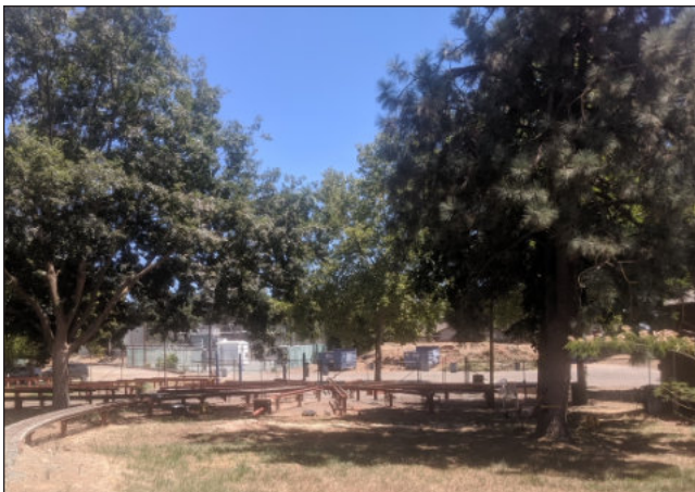
One down, one to go.

August Board meeting changed to the 15 th .