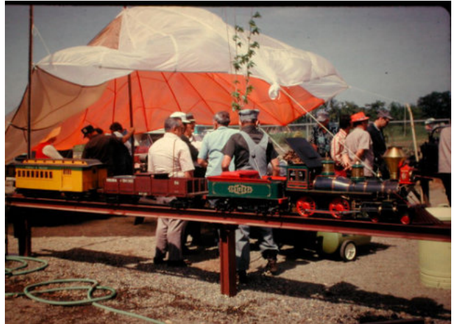
Orange colored shade tree to stay cool.