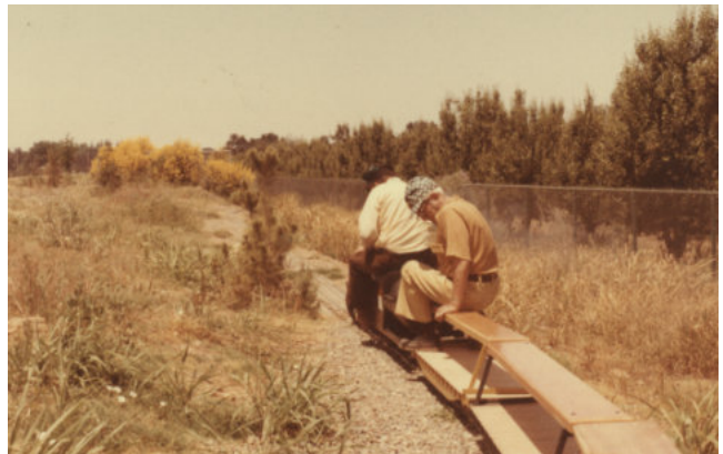
Testing the completed track in the park.