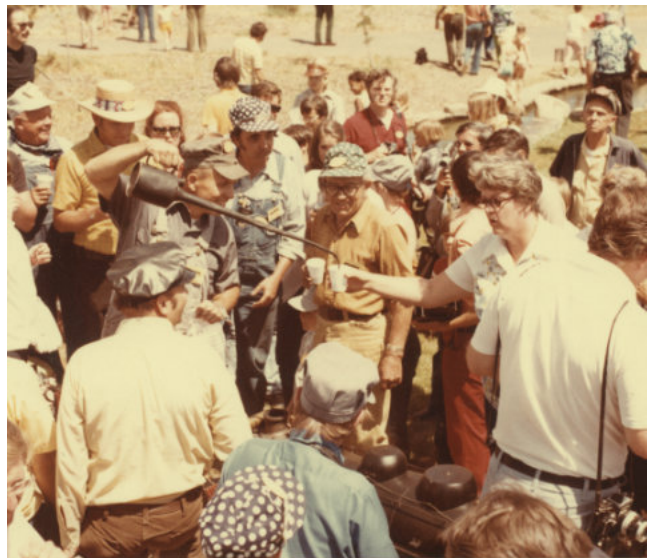
The celebration drink!