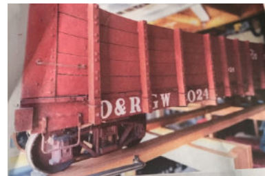
#6: 1" Scale Coles 040 $1500