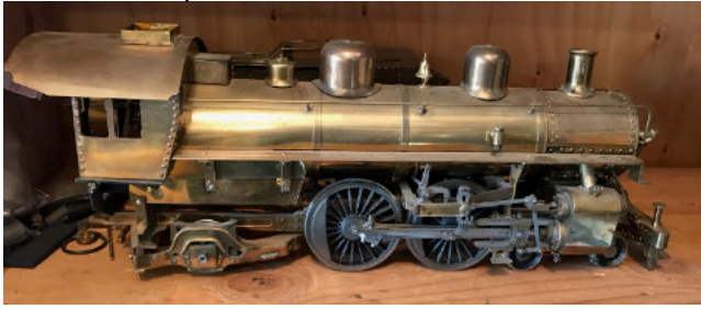
Item 1: 1/2" Brass Atlantic and Tender $2500.

For SALE: contact Robert Morris Leave message at 925-240-9034