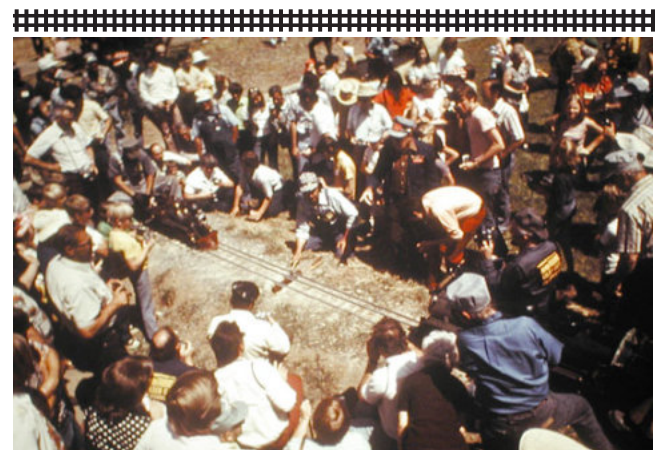
1973 spike event.