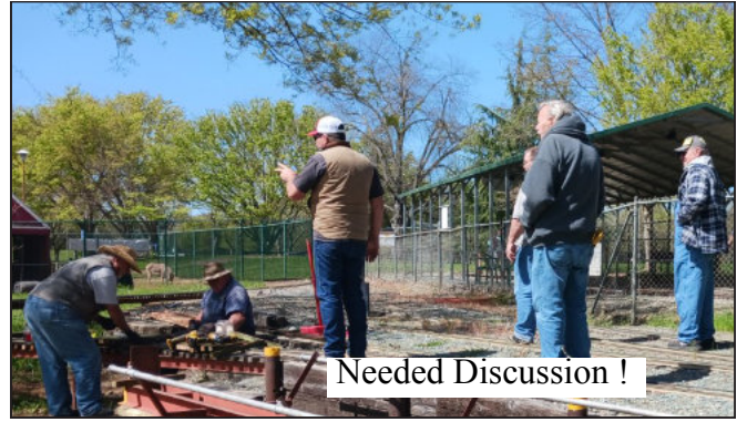
Needed Discussion !