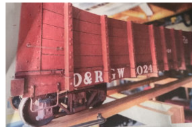
#6: 1" Scale Coles 040 $1500