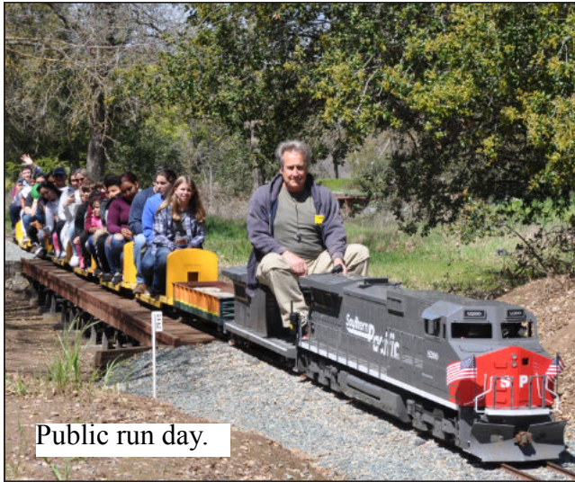
Public run day.