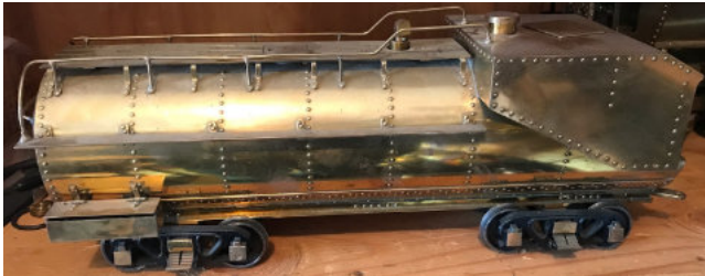
Item 3: 1 1/2 inch Allen 2-6-0 Mogul and Tender $13,500.