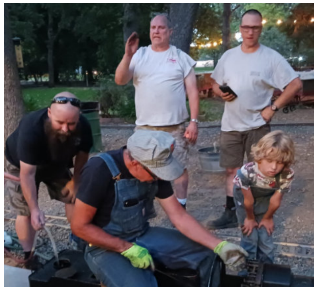
Everyones looking !