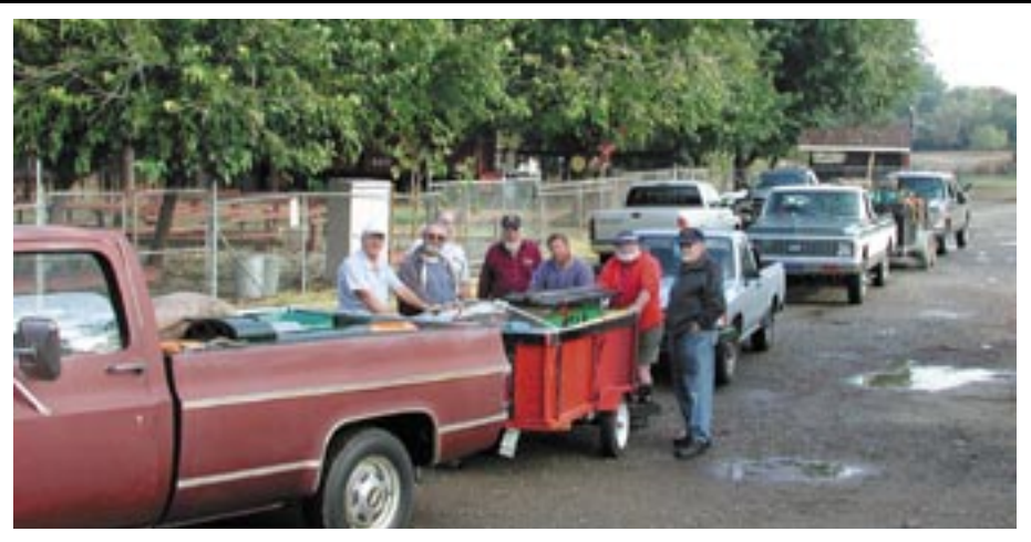
The parade of trucks with all the equipment going to the rail fair.

I would like to give a hearty Thank You to those mentioned below for all their dauntless work at Roseville rail fair. Once again many, many thanks to you all. I appreciate the immense effort, a good time was had by all. Hope to see you again next year.