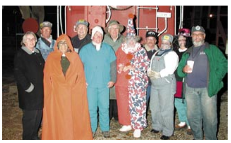
The SVLS crew - is that spooking enough?