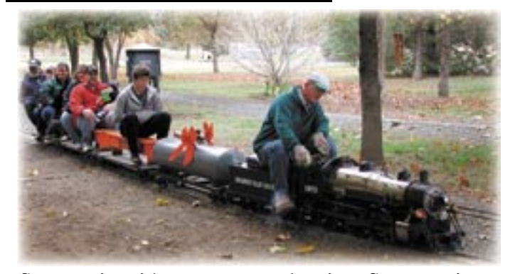
Santa train with a passengers leaving Santa station