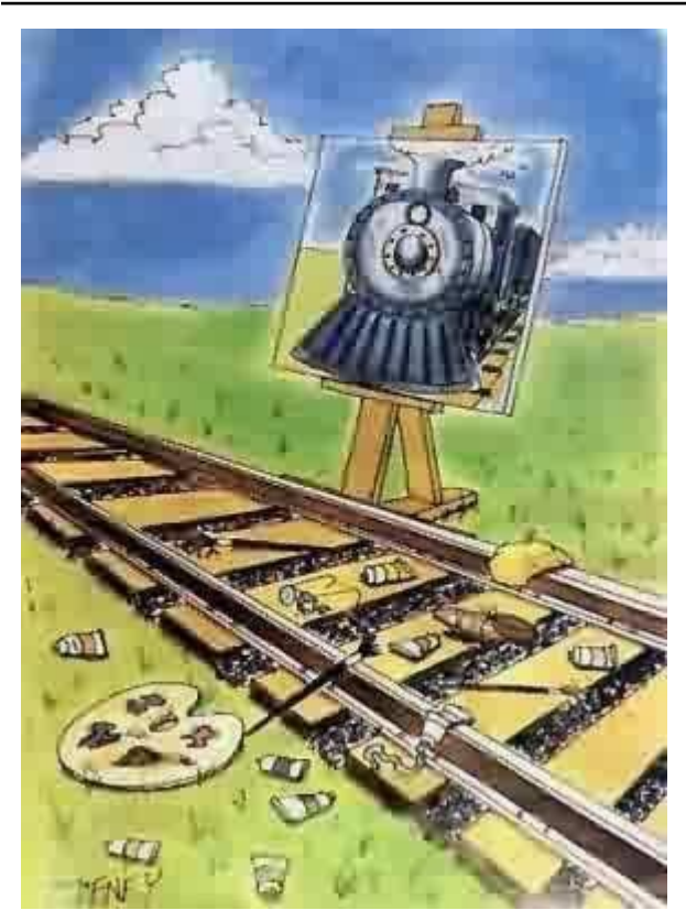
Painting for sale, Artist not found.