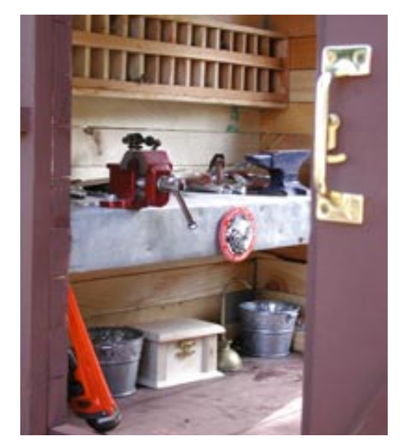
Jeff Badger's tool caboose with lots of tools and spare parts to keep the train running.