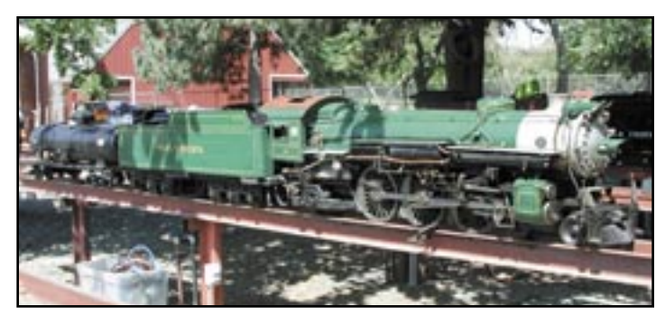
Milon Thorley's Southern 4-6-2 locomotive