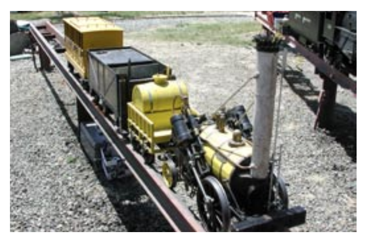
Roy McInnes brought an 1-1/2" scale model of the Rocket engine. The engine was built by his grandfather and is coal fired. (It also started 3 fires along the fence which had lots of dry grass.)