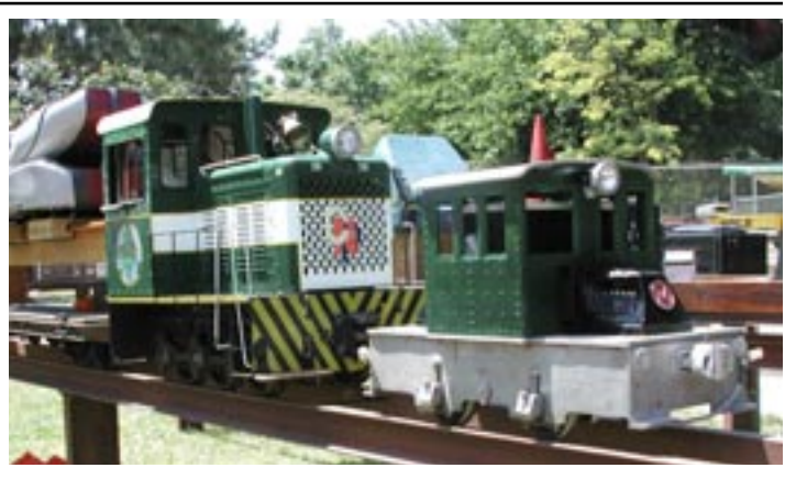
Small gas engine and a smaller electric (Big Mac).