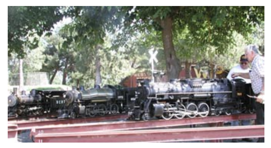
Steaming bays: Gill Beaird with Nickel Plate Road #765 a Berkshire locomotive, the club engine and Neil Heath engine.