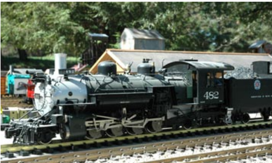
The "G" gauge was present at SVLS track thanks to the Garden Railroad club on two occasion in 2004. It was fun for both groups playing with both scales of trains.