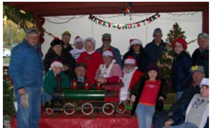
Santa Run volunteers. Thanks to all for two days of trains and Santa.