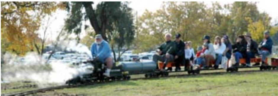
Steamer pulling public at Roseville International rail fair. Two days of trains of all sizes.