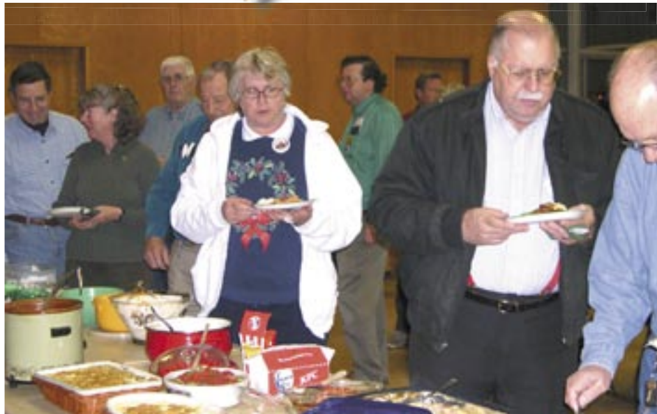
Good food and time with friends at the December pot luck dinner. Many thanks to all that took the time to bring food for all to enjoy.