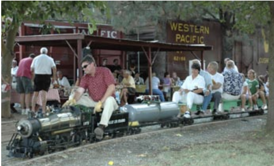
The Rotary Clubs and guests having a dinner enjoying rides on our trains. - Thanks to all that helped.