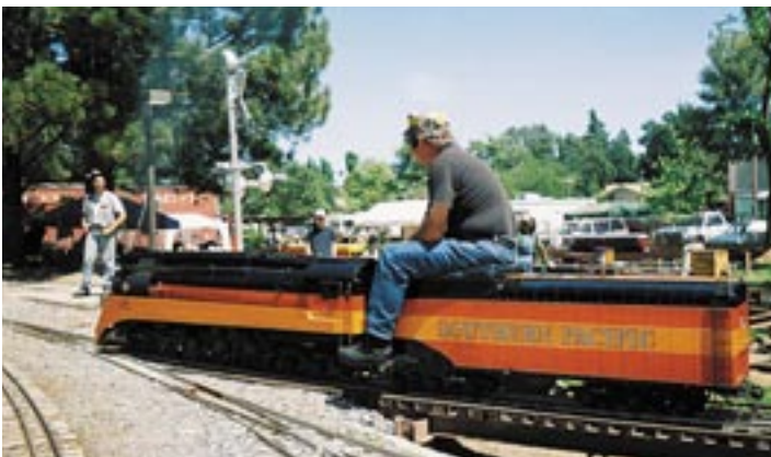
SVLS SPRING MEET - Craig Craddock with his SP Daylight