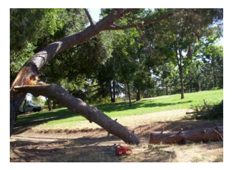
Vern had some unplanned clean up when the Pine tree on the main line into the station decided to block the track. Thanks to Dave & Pat Mattox and Allison King for coming out to clear the mess up.

As the weather cools off there will be the need for people to come out and help remove dead trees and to trim those that need it. I will be putting out messages and phone calls to those that can come out when I can see a scheduling opportunity.