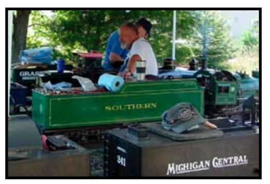
His visit to the Michigan Central Railroad for an Operational meet in 2004