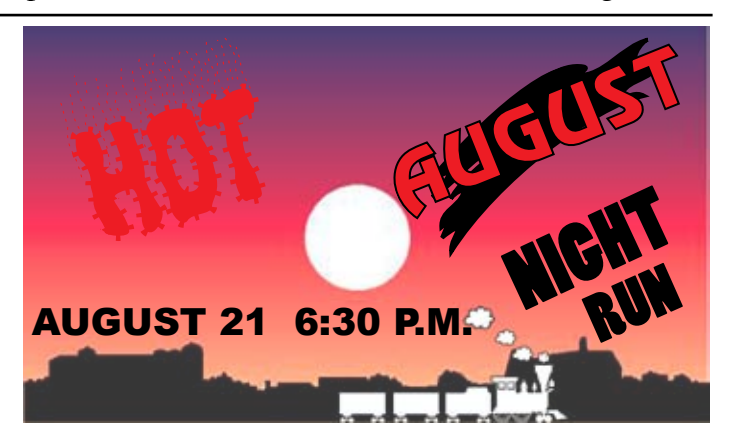
Bring your Train and your appetite and food to share. Join us for a Pot luck dinner and a fun night around the old railroad tracks.

This year we invite members to camp overnight so that they can enjoy late night running without the need to pack-up and leave. Several people from the Spring Meet commented on the enjoyment of running at night - much cooler.