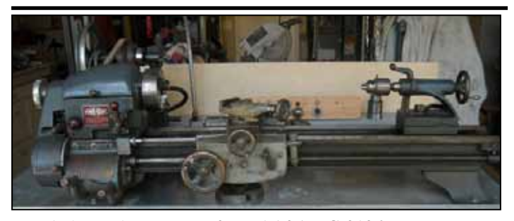
Wards (Logan) Power-Kraft Model 25TLC-2136 Back Geared Screw Cutting Lathe with Quick-change Gear Box 10" Swing - 1-1/2"-8 #3 MT Spindle Bore 50" Bed Length - 31" Between Centers Spindle Bore 25/32

Includes: 3-Jaw & 4-Jaw Chucks, Jacob's Chucks for Headstock & Tailstock, Collet Set, 6" Face Plate, 110 Volt Flat belt drive $1000