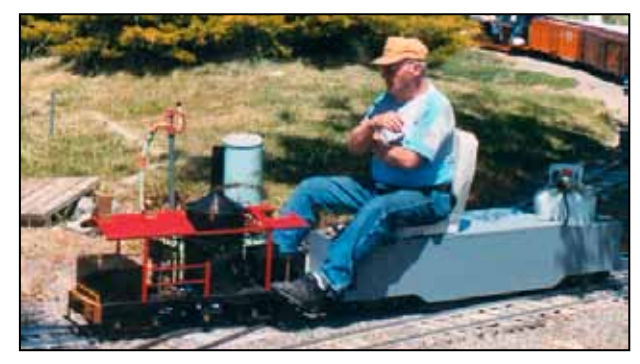
1.5" scale, 7.5" gauge Clishay locomotive and riding car. Engine is a two cylinder double acting 1 1/4x1 1/2". Boiler upgraded from the original 8" diameter water tube to a steel 10" diameter propane fired fire tube boiler with 73 1/2" copper fire tubes. Pneumatic FWD/REV shift and brakes on locomotive. Usual Accessories: working headlight, bell, new whistle, two new relief valves, engine driven feed pump and a hand pump. New body and trucks on riding car.

Asking $6,500, RTR. Reasonable offers considered. Contact Bill Cody at (775) 674-6512 or steamboatbill@sbcglobal.net for additional information/pictures. http://www.svlsrm.org/sale.php