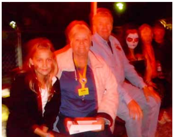
There are ghosts at the railroad - very strange!

On another note: RS3 cold start. Right lever in neutral, Left lever back, Choke out all the way, Switch on (forward), Throttlel mid position. Press start button right side to start engine. Engine started then move choke to mid position for one minute, then choke off.