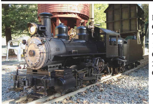
Freelance 7.5" Gauge 0-4-0, 7.5" Gauge, 1.5" Scale, Oil Fired, 2" Winton Cylinders

More pictures on request. email mjbaker.1@juno.com or 503-910-8302 Mike Baker - See you at Spring meet.