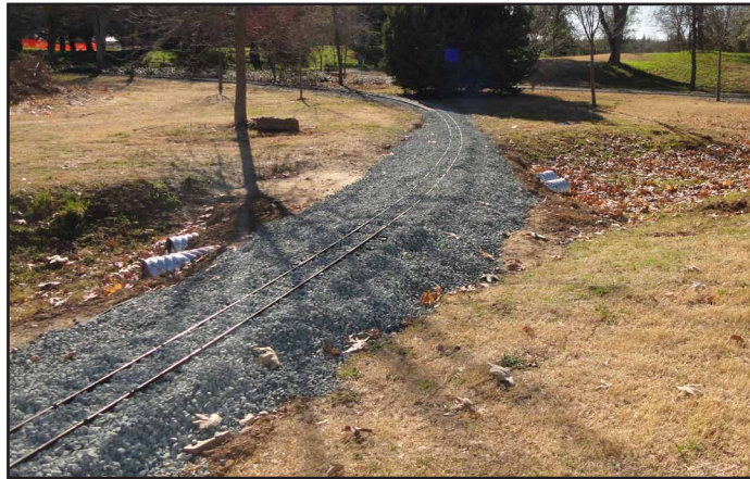
The new track and berm (replacing the rotted trestle). Thanks to the many that gave a helping hand.