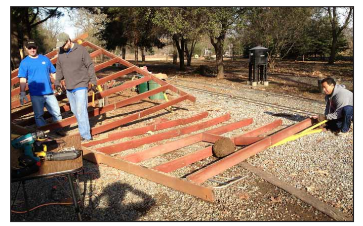
Prior work by Intel crew was to remove the old shade cover, they made quick work. Thanks.