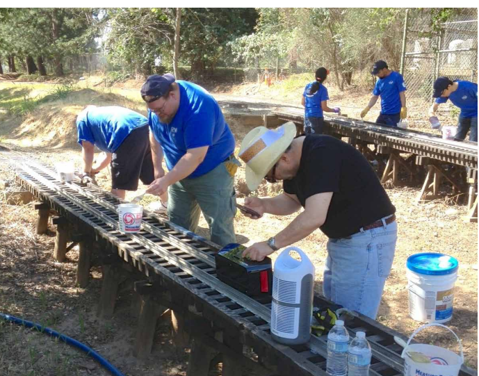
Intel crew volunteers providing needed maintenance on our trestle.