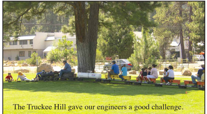
The Truckee Hill gave our engineers a good challenge.

a beautiful setting. Many of our group expressed an interest in doing this again. Maybe YOU would like to join in next time?