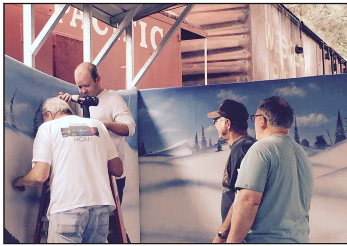
Crews busy putting up decorations for Santa run. Well, at least 50% are working.