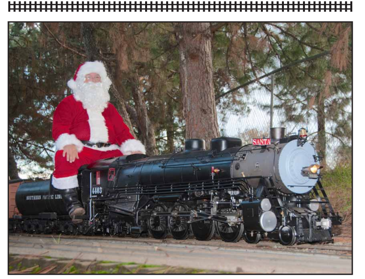
"High Ball" Santa - no reindeer needed here to make his rounds.

We were honored with special entertainment from Toy Yungling, as she performed two traditional dances. Thanks Toy.