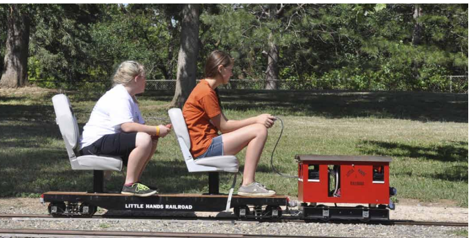
Kids of all ages had fun at our meet! Please see pictures on our web site: http://www.svlsrm.org/Meet_Photos.htm