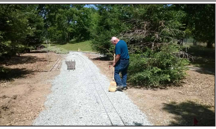
The new look of Reverso as it gets its final sweeping. Thanks to all who helped over several days.

The club need more members to be active with our public ride days, and our special events (Parties) as we are short of people to provide this service. These events provide our main source of income so please come out and help. If you need to qualify you can take the written tests on line, then come to the track to finish your qualification.