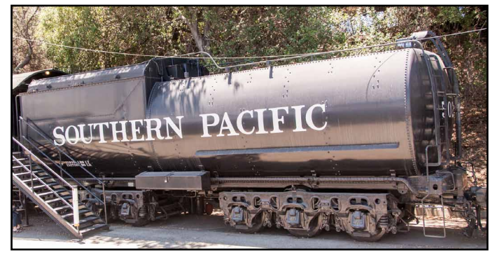
Currently I am in the process of finishing the detailing and making many of the missing parts the prototype tender sported yet are lacking on my model. Meanwhile at the LA County Fairgrounds, in the town of Pomona, a group called Rail Giants

As small as our hobby is compared to many other recreational endeavors there is a still decent selection of engines and cars available for purchase, either ready to run or as kits. Some of us however, would like a model that there is no kit or parts for. For someone wanting to build a steam locomotive, especially one that no longer exists, research is the order of the day. In my case there are no GS-1's to be found. There are similar locomotives that still exist and thanks to Common Standards adopted by the Southern Pacific Railroad, many of their steam locomotives share common components. That was especially true of tenders.