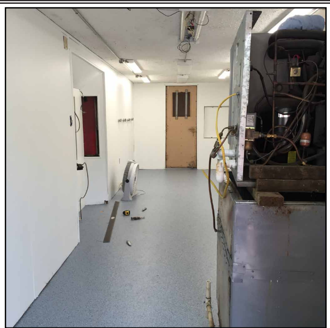
Caboose new floor and paint in progress.