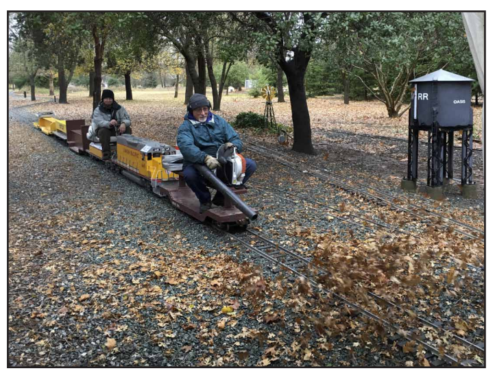
Have leaf blower will travel.

Thanks again and I hope to see you out on the rails.