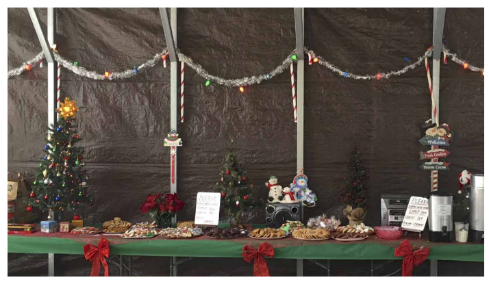
Santa Run cookie table