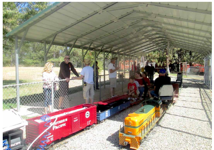
Oct. 1 public run day.