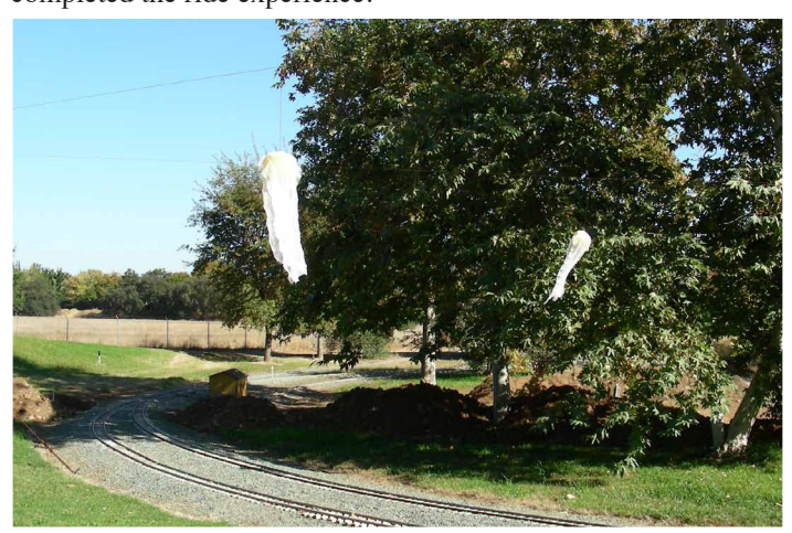
Above the flying ghosts that moved above the tracks and at night (below) they glowed. (yes its dark, but so was the night)