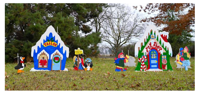
Track side displays

Locomotive owner name is wanted. Photo was taken in May of 1991 at SVLS. The people are from Sydney, they were at Railfair 91 then here at our SVLS park and drove this engine. Anyone know who owned the engine?