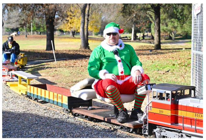
Santa Elf pulling into station to load passengers