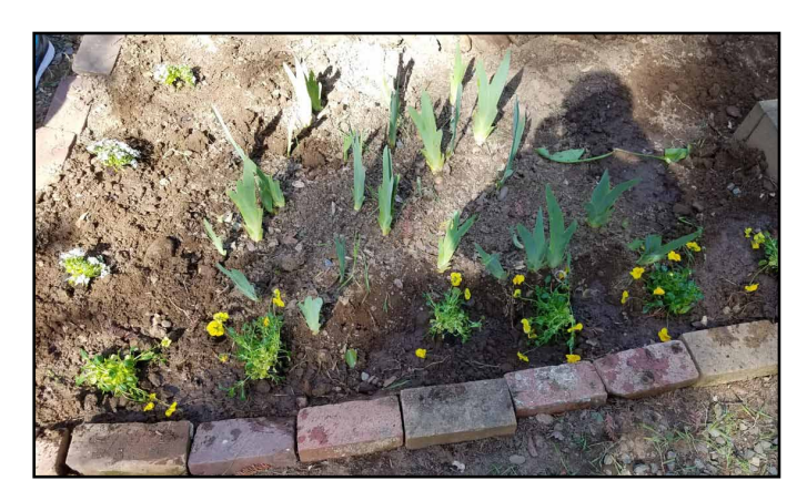
Garden Girl project for Spring