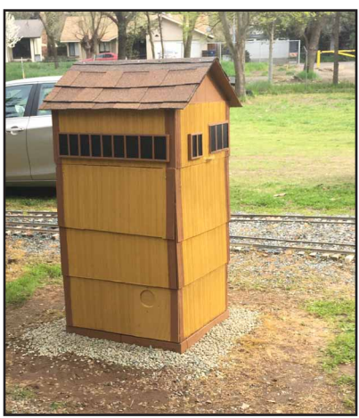
Touch up of Mercer tower