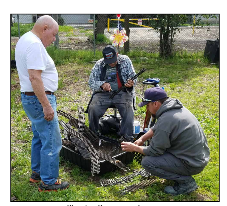
Cleaning G gauge track