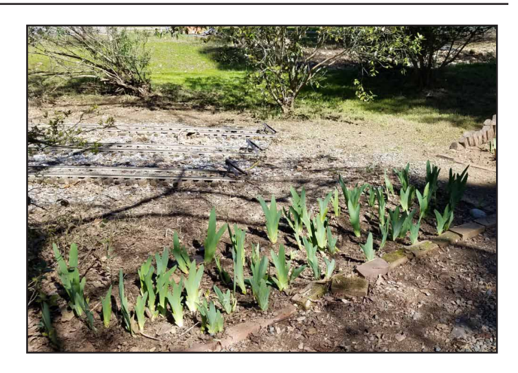
Iris bed cleaned out