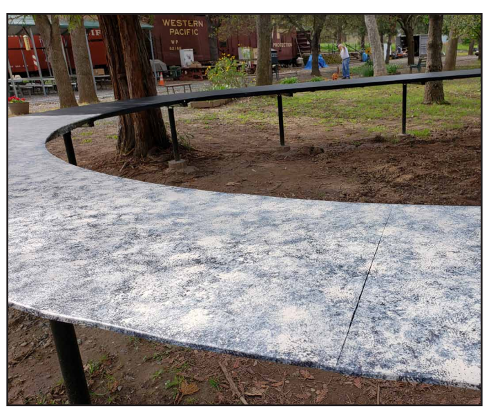
Table with finish paint pattern.