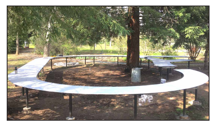
Phase one table progress

Many volunteers have been helping with this project, thank you to each and everyone! We will need your help this first weekend!. Thanks, Phil Huntingdale