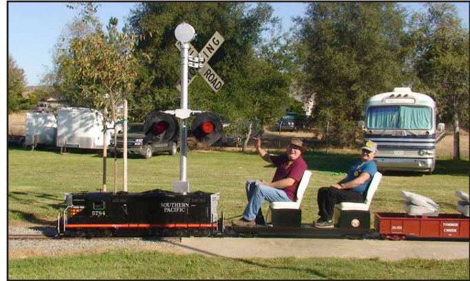
20 Years ago: (missing news letter - if you have Oct. 1999 let me know.)