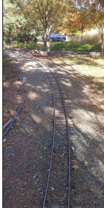
North: looking at memorial grove.