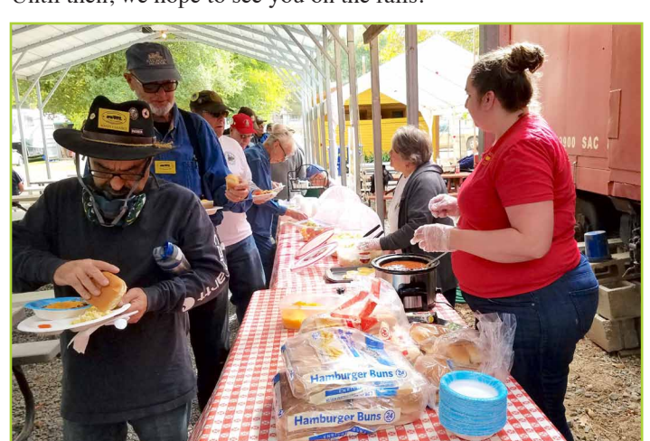
Lunch food line at Fall Meet.

Until then, we hope to see you on the rails.