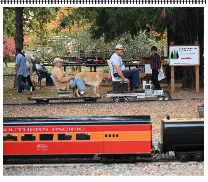
Even our four legged friends enjoy a train ride.