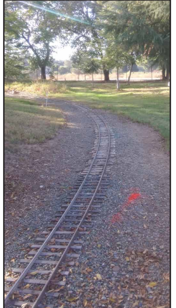
Looking at the main line inside the north gate.

Other projects for the winter are: 1. replace the track from Hillview east, north switch up to the snow shed. 2. Replace 2 aluminum track switches with steel track switches.